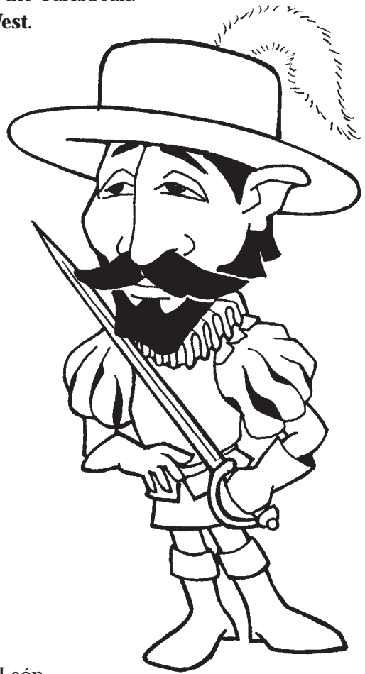
JUAN PONCE DE LEÓN

In 1513, Juan Ponce de León sailed from Puerto Rico with three ships and about 200 men. Instead of finding the Fountain of Youth, they reached the east coast of St. Augustine in present-day Florida. Ponce de León claimed all of Florida for Spain and named the area "Pascua de Florida" which means "land of flowers." He sailed down the coast where he experienced some very rough currents . He named the area Cape Canaveral, or "cape of currents."