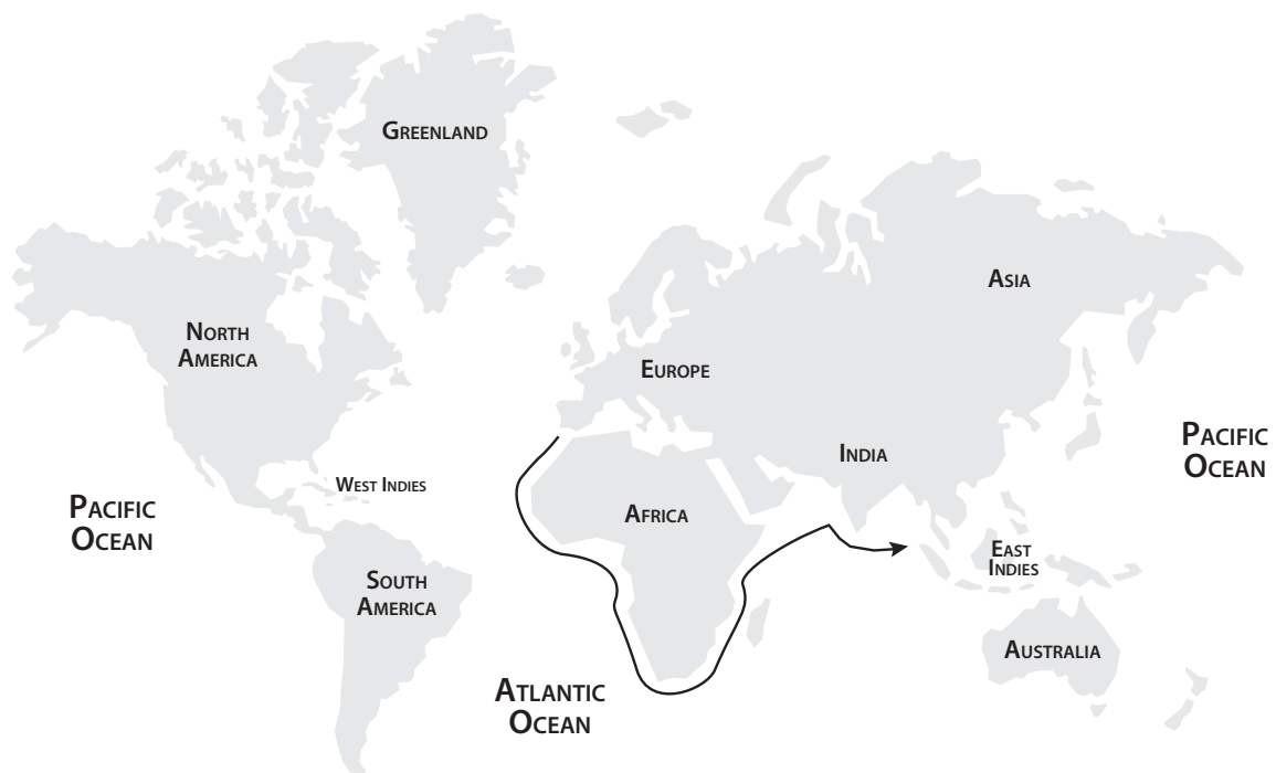
— EASTWARD ROUTE TO THE EAST INDIES

Christopher Columbus believed that by sailing west, he could find a shorter and safer route to Southeast Asia. He estimated that the East Indies were just 3,000 miles west of Europe. He did not know, of course, that the continent of North America stood in his way. Southeast Asia was actually 10,000 miles west of Europe!