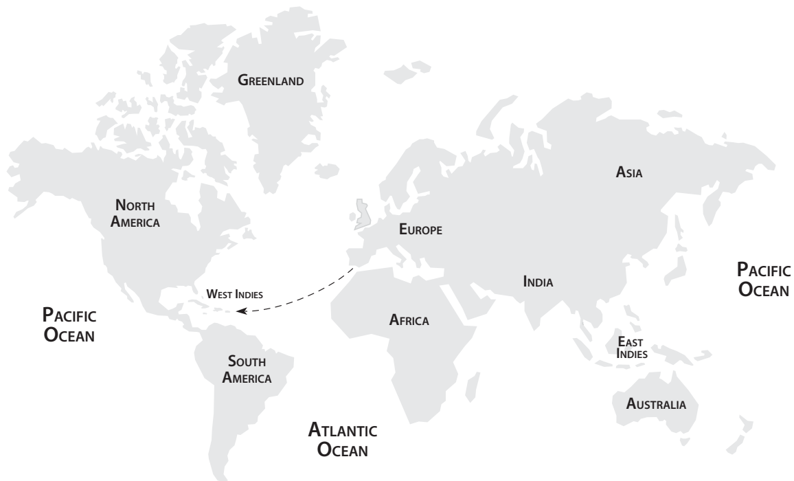
----- CHRISTOPHER COLUMBUS'S ROUTE TO "ASIA"

There were more than 40,000 Indians living in the West Indies when Columbus arrived. Since these people were the first inhabitants of America, we call them Native Americans today. Columbus wrote in his journal that he thought the Indians would make good slaves. They didn't seem to have any religion of their own and he believed they could easily be defeated with about 50 men. Columbus took six Indians back to Spain with him.