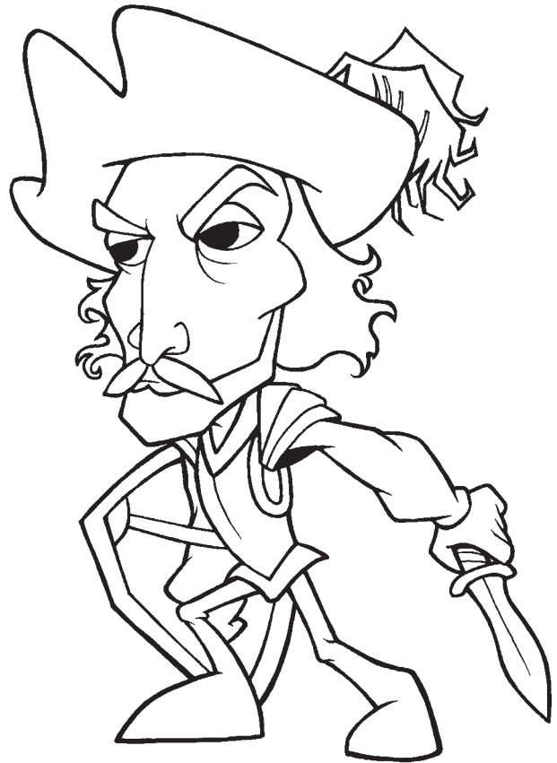
HERNANDO DE SOTO

In the spring of 1542, Hernando de Soto became very ill with a fever. He died from his illness. To keep his death a secret, de Soto's men wrapped his body in a cloth and dumped it into the Mississippi River. Hernando de Soto's expedition had failed to build colonies, discover gold, or find a safe route to Asia.